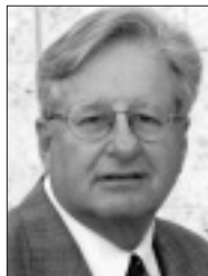
Donald Meichenbaum, Ph.D.

Donald Meichenbaum, Ph.D. , is Distinguished Professor Emeritus at the University of Waterloo, Ontario, Canada and one of the founders of cognitive-behavior therapy. He has consulted and lectured worldwide on the impact of trauma and has published major clinical handbooks on Treating Adults with Post-traumatic Stress Disorder and Treatment of Individuals with Anger-Control Problems and Aggressive Behaviors (which often co-occur with trauma reactions). In a survey reported in the American Psychologist , he was voted "one of the 10 most influential psychotherapists of the century." Dr. Meichenbaum is Research Director of The Melissa Institute.